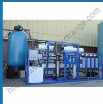
Reverse Osmosis Plant Process