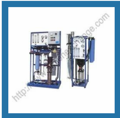
Commercial Reverse Osmosis Plant