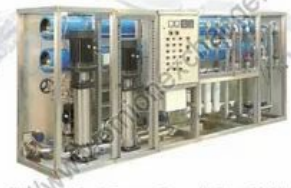
Pharmaceutical Reverse Osmosis Plant-6000lph