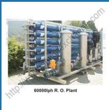
RO Plant 60000LPH