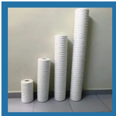
Water Filter Cartridge