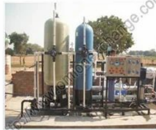
R. O. Plant with Softner - 2000lph