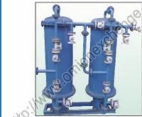
Mixed Bed Unit