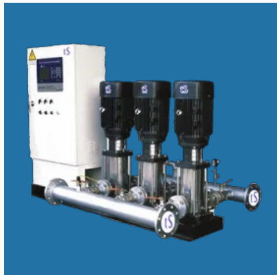
Booster Pumps And System