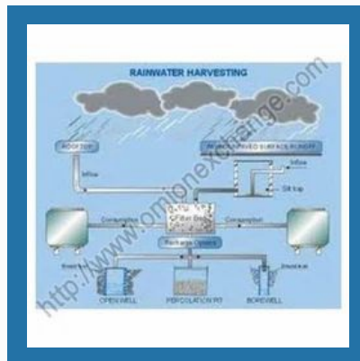
Rain Water Harvesting System