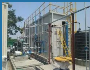
Effluent Treatment Plant