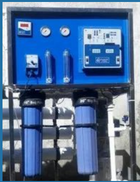
Water Treatment Systems