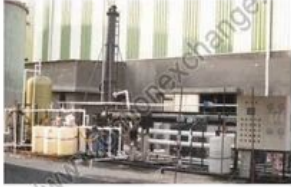
Pass System R O Plant 5500 LPH