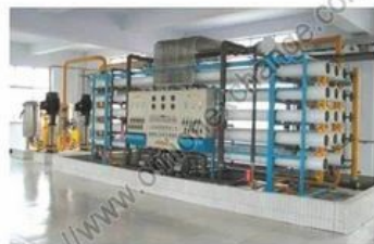
75000lph R. O. Plant