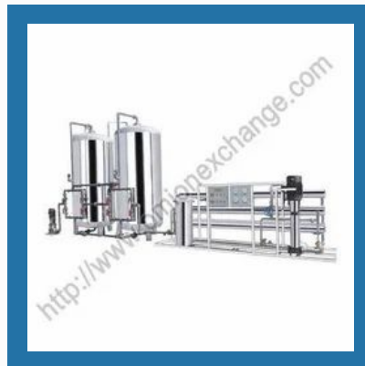
Water Purification Machine