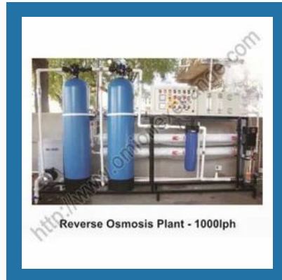
Reverse Osmosis Plant - 1000LPH