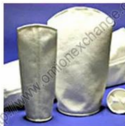
Cotton Filter Fabrics