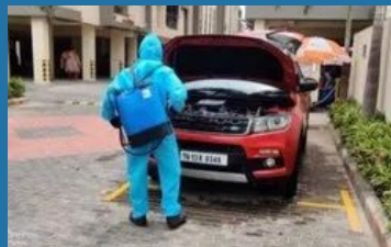
Car Fumigation Service