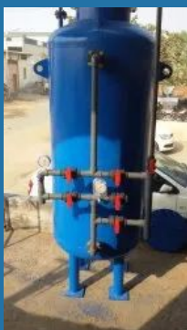
Activated Carbon Filters