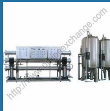
Reverse Osmosis Plant