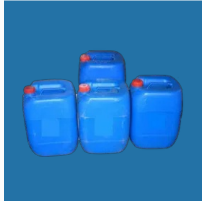
RO Plant Chemical