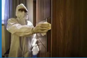
Hotel Sanitization Service