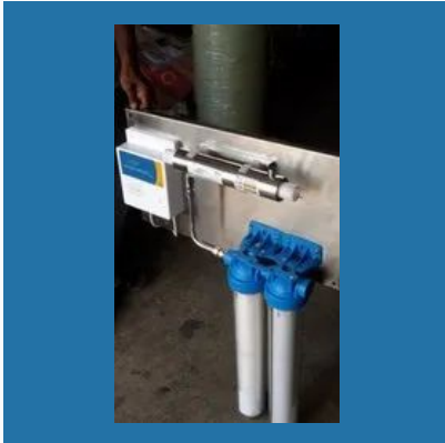
UV Water Treatment