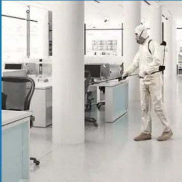
Office Sanitization Service