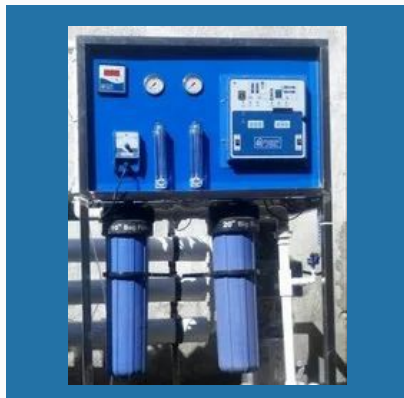
Compact Water Treatment Plants