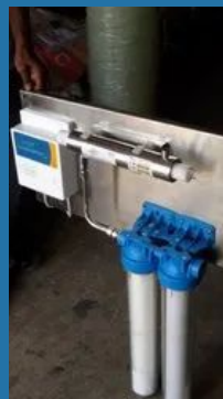
UV Water Purifiers