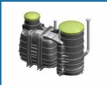
Modular Sewage Treatment Plant