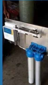
UV Disinfection System