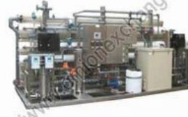
Double Pass Reverse Osmosis Plant - 6000lph