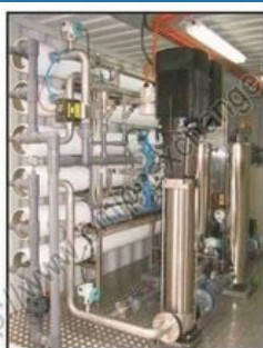
Container R. O. Plant - 25000lph Supply in Costal Area