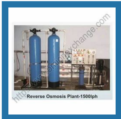
Reverse Osmosis Plant - 1500LPH