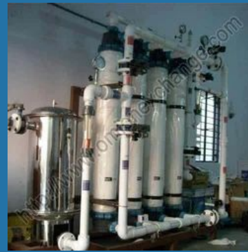
Ultra Filtration Plant Process