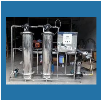
Water Treatment Plants