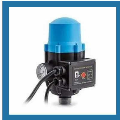
System Without Pressure Tank