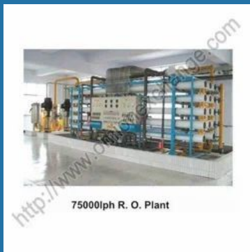
RO Plant 75000LPH