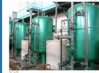
Ion Exchange Equipment