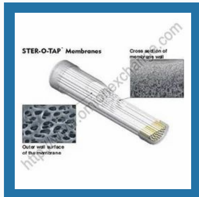
Ultra Filtration Membranes