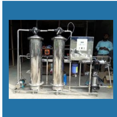
Reverse Osmosis Plant 500 LPH