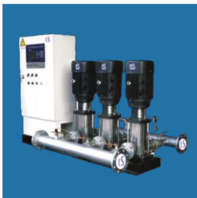
Hydropneumatic Pressure System